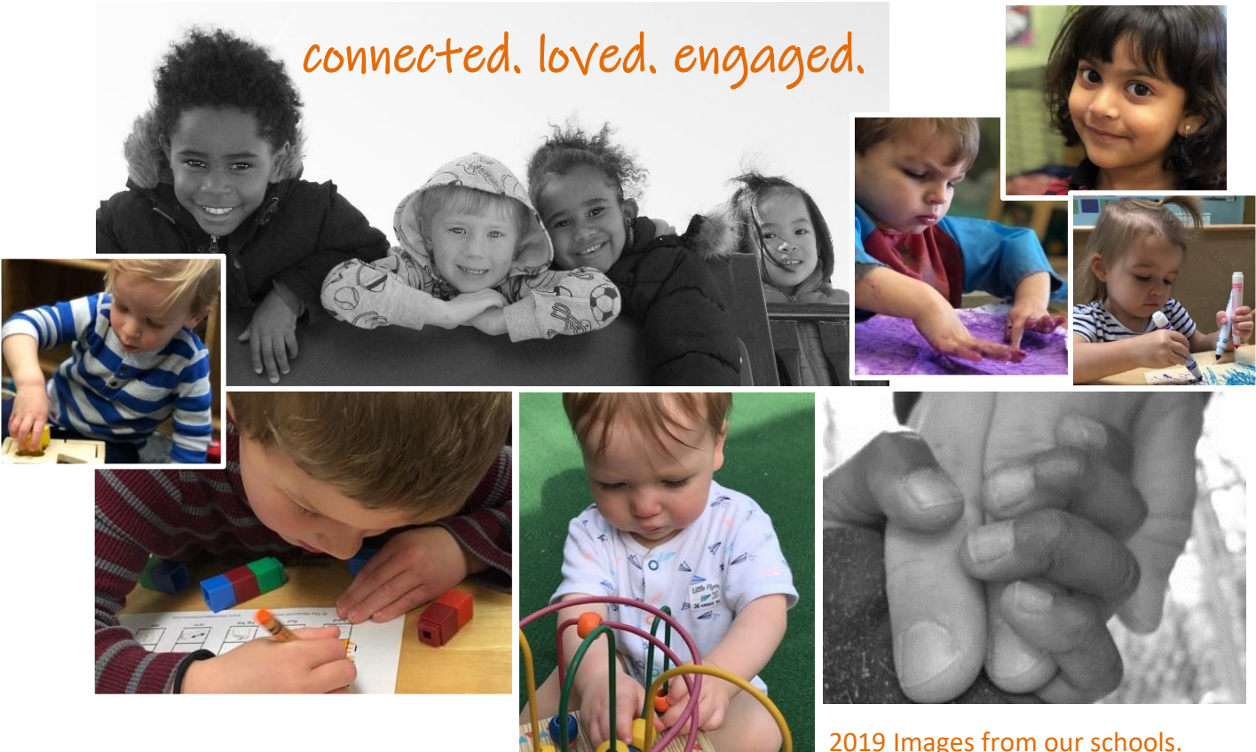
2019 Images from our schools.